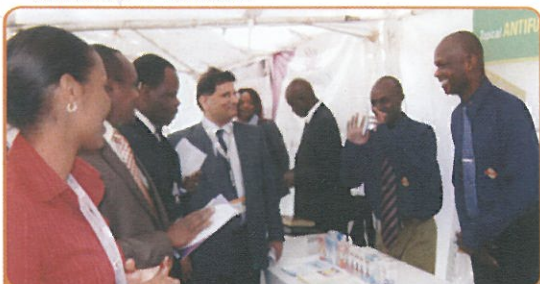
Regal staff welcoming guests to their stand during the Kenya Medical Association (KMA) Annual Scientific Conference held at Sirikwa Hotel - Eldoret in April 2010.