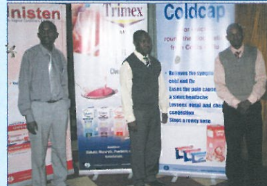
Nairobi area medical representatives attend the PSK monthly general meeting