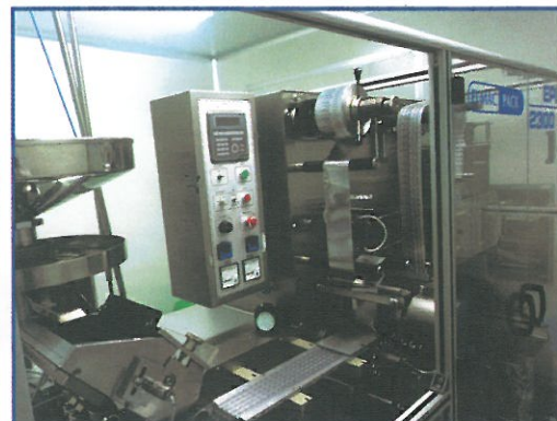
The new double track blister packing machine installed at Regal Pharmaceuticals Ltd.

As part of our facility modernization program, we have just installed and commissioned a new double track blister packing machine replacing an old single track one. The new entrant is the latest model in the market with superior operator MMI control panel features and, most importantly, producing elegant blisters that match the product quality. The GMP compliant machine constructed with SS316 in all product contact areas and SS304 in non-contact areas has its front side covered with acrylic guard as a key operator safety attribute. Moreover,