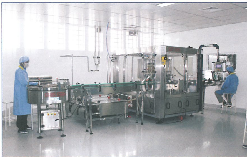
The new Liquid line in General (non-Penicillin) unit.