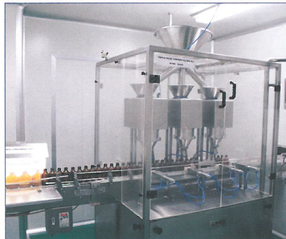
The new Dry Syrup line in Penicillin unit.

Regal Pharmaceuticals has commissioned two new manufacturing lines to match the market demands and continue to provide quality health to all, within the region. A new dry syrup filling line was installed in the Penicillin unit and a new oral liquid filling line was installed in the General (non Penicillin) unit. Both the lines were commissioned in the month of March 2009. All the machineries are, as per the latest standards & norms of current Goods Manufacturing Practices (cGMP).